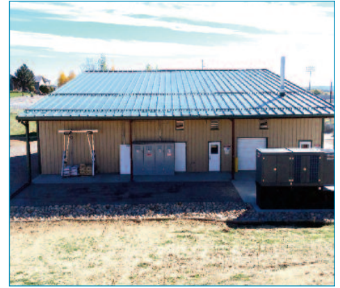
Completed Treatment Building

e) Process area systems in the new building included: finished water high service pumps, an ultraviolet disinfection reactor, flow measurement device, one Actiflo filtration system, backwash feed pumps, polymer make-up and feed system, coagulant storage and feed system, ancillary mechanical and electrical systems, gaseous chlorine storage and feed room, chlorine dioxide generation room, electrical/instrumentation controls room, and office/control room.