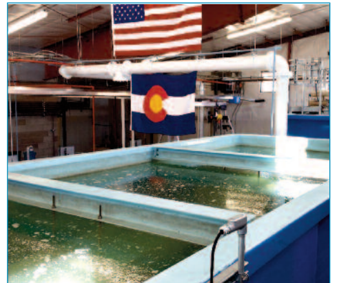
Dual Media Filter and Blower Piping