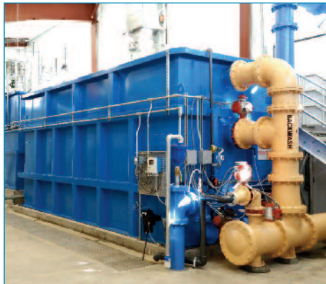
1 MGD Actiflo and Dual Media Filter Train