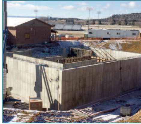
Completing Tank Walls