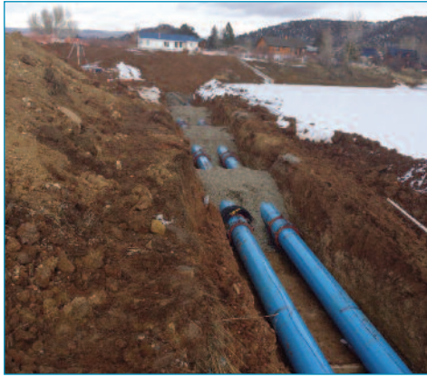
Reservoir Bypass Lines