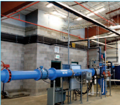
Finished Water Service with UV System and Blowers in background