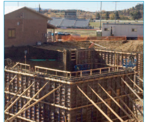
Tank Walls Formed