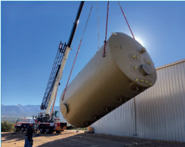
45,000 gallon effluent storage tank being set