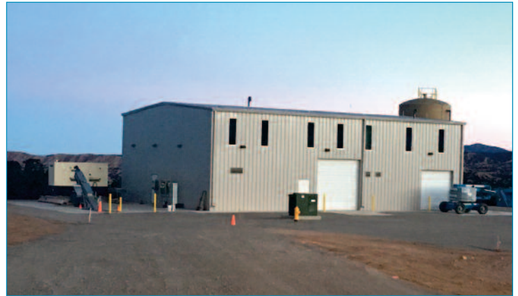
Constructed Metal Treatment Building

The MBR treatment system will have a design capacity at 80,000 GPD at full build out, which includes the Casino and a future 150 room hotel. IWS is providing a