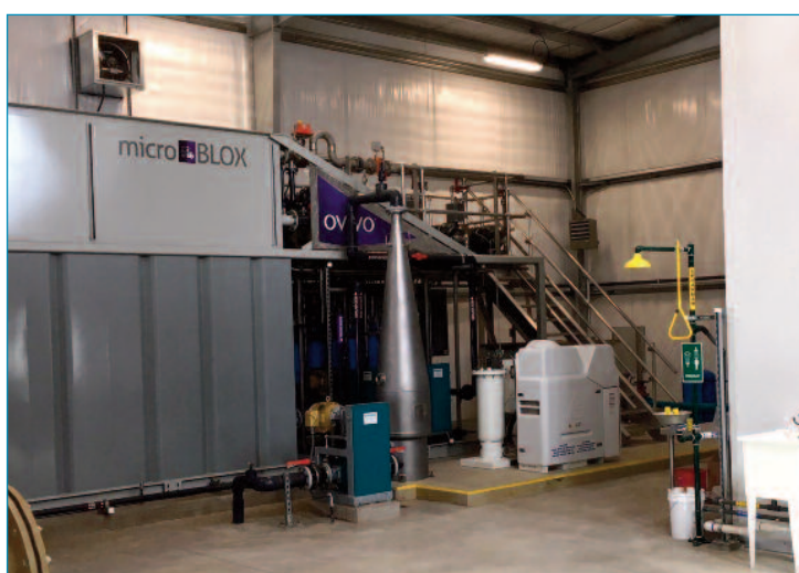
Ovivo MicroBLOX MBR (right side view)