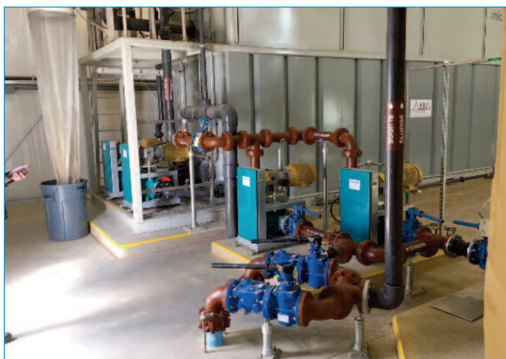
Ovivo MicroBLOX MBR (left side view)

Treated effluent will be stored in a 45,000 gallon above grade FRP storage tank. The advanced wastewater treatment of the MBR will allow the effluent to be re-used to irrigate the parking and casino property landscaping, reducing the potable water demands for the facility. All surplus effluent will be sent to a Low Pressure Dispersal (LPD) system consisting of 5 LPD fields of 6 zones for a total of 18,000 linear feet of