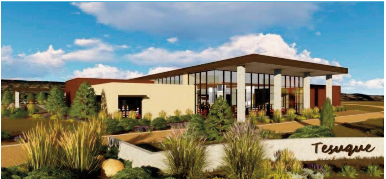
New Tesuque Casino

turn-key treatment system including a 21,000 gallon equalization tank, 8,000 gallon sludge tank, headworks rotary bar screen, Ovivo Packaged MBR treatment system ( www.ovivowater.com ), chemical feed systems,