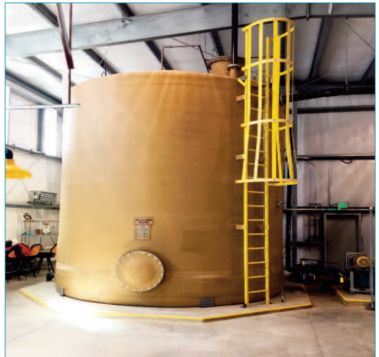
Flow equalization tank (21,000 gallons)

IWS teamed with Souder Miller Engineers ( www.soudermiller.com ) of Albuquerque, NM and was selected based on the collective experience of the team and its ability to meet challenging schedules. The IWS/Souder