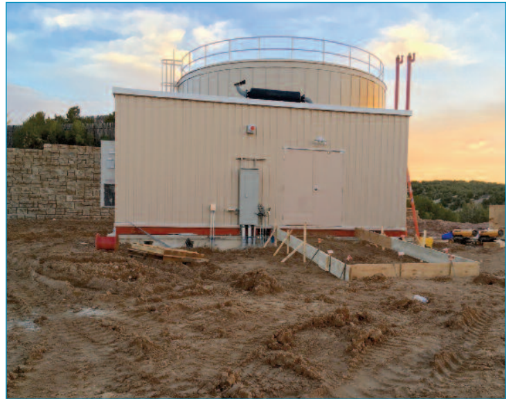
200,000 gallon water storage tank and pump building

disposal trench with manifolds, supply lines, and valves. IWS also installed all the electrical components including: Main control panel (230/460 volt, 60 Hz, 3 phase), enclosure with magnetic starters, circuit breakers, programmable time clock, HOA switches, and master SCADA. All required A/G conduit, pull boxes, wire, cable, terminations and mounting brackets and unistrut for complete fully operating systems. Completed all electrical testing for IWS installed equipment.