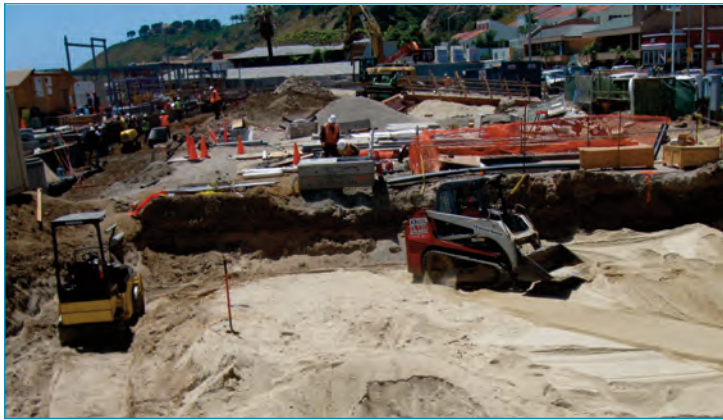
Installing engineered fill for leachfield