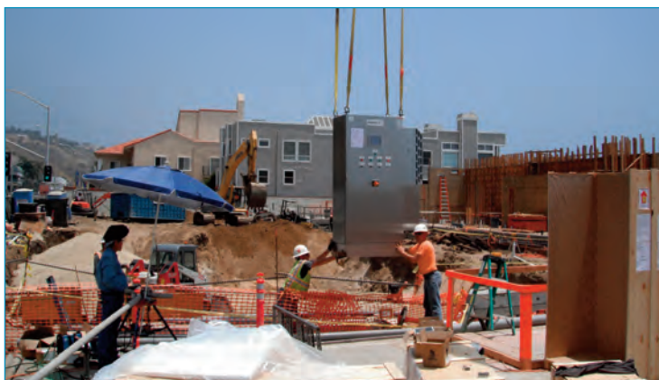
Installing control panel in vault