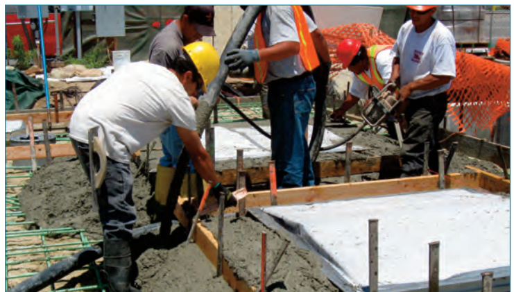
Pouring concrete tank cover pad