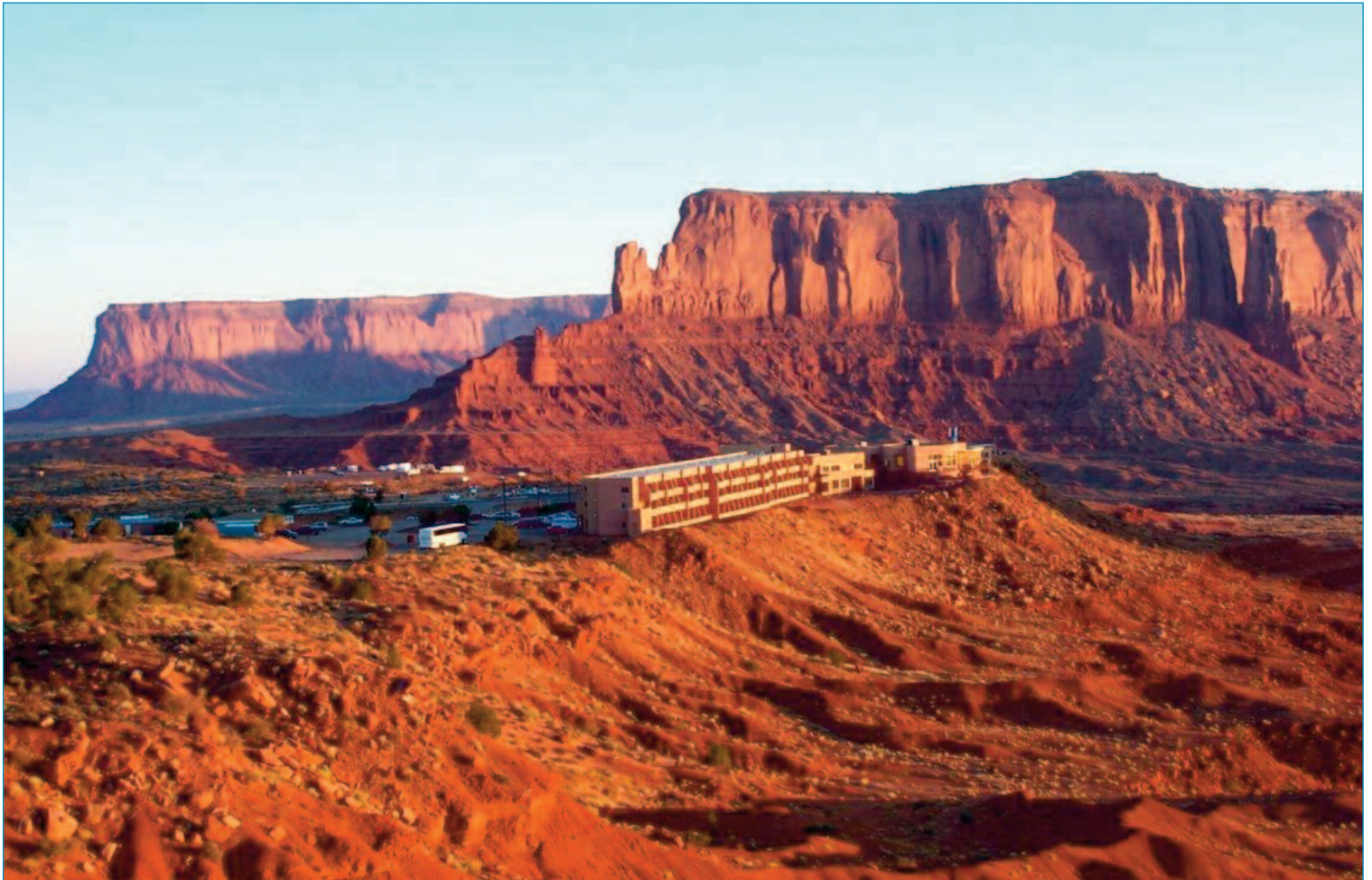
The View Hotel

The wastewater treatment system was designed Richard Jex, PE. The AX-Max units were placed below grade to minimize any visual impact to the beautiful landscape and canyon views. The modular nature of the AX-Max units allowed the facility to accommodate the variable flows from the seasonal nature of the tourism industry in Monument Valley.