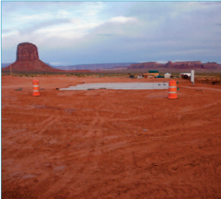
Completed site with access to tanks and AX-Max modules at grade