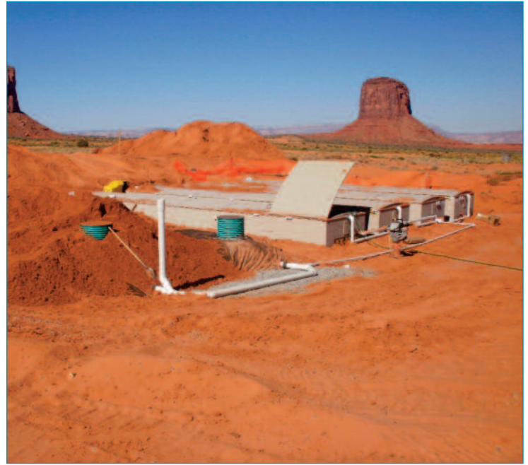
Fiberglass tanks and AX-Max modules prior to final backfilling